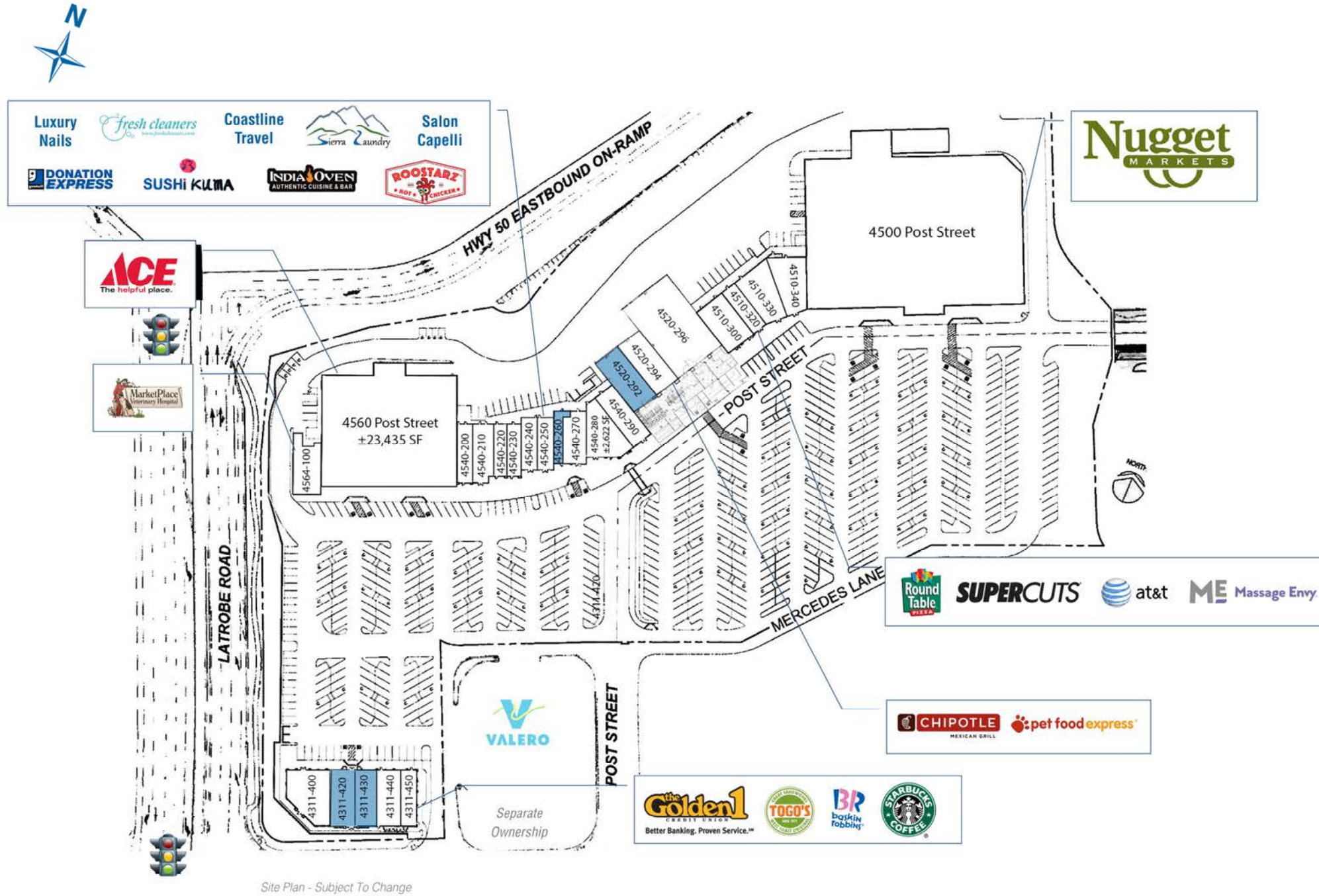
Site Plan - Subject To Change